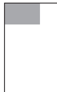
2 COL. QUARTER PG. 3.875 x 2.25