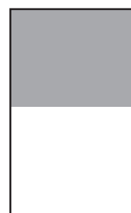
HALF PAGE 6 x 4.75